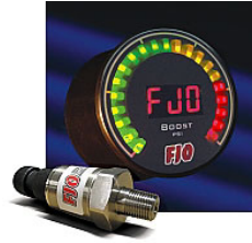
GBP0035 Boost Pressure Gauge 35 PSI