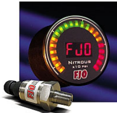
GNP1500 Nitrous Pressure Gauge 1500 PSI