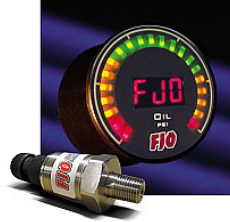
GOP0100 Oil Pressure Gauge 100 PSI