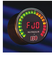
GND0010 Nitrous % Gauge 0-100 %

(for use with the NX Maximizer or FJO Tri-Stage controller)