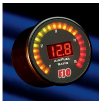
DWB0003 Wideband Air/Fuel Ratio Gauge (for use with the FJO Wideband AFR Analysis System)