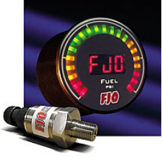
GFP0100 Fuel Pressure Gauge 100 PSI