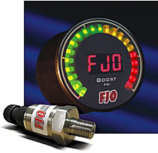
GBP0015 Boost Pressure Gauge 15 PSI