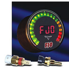
GTF0010 Temperature Gauge Fluid (coolant or oil) Air - slow response only (intake or outside) Fahrenheit (-40°F to +302°F) ORDER SFT0001, SFT0002 or SAT0010 SENSOR SEPARATELY